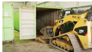
FOGO goes into the Gaia Rapid Composter for pasteurisation