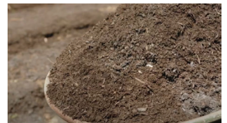
Compost can be used locally on parks, gardens, farms etc.