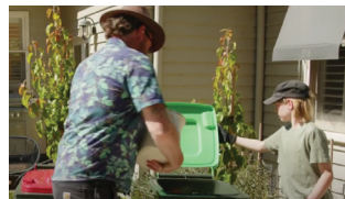
Place it in the FOGO bin