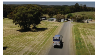
FOGO bin gets collected