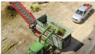
The Gaia team will prepare the FOGO