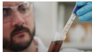
Processed materials get tested to ensure they meet Australian standards