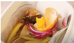
Collect food and other organics at home