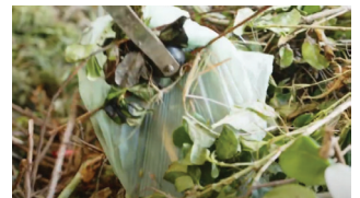
Contamination including plastic gets removed at the council's waste facility